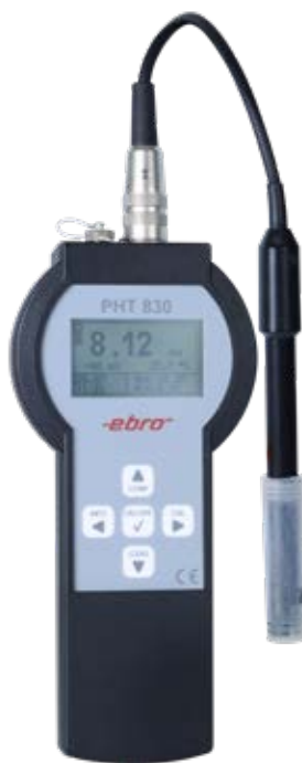
PHT 830 pH Meter