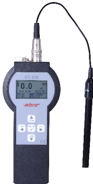
CT 830 Conductivity Meter