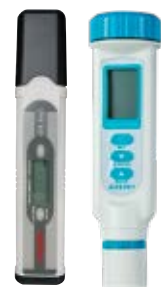
pH and Conductivity Standard Tester